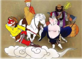
西游记 Journey to the West