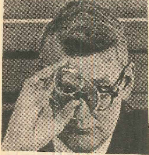
Photo by KEN SCHONWALTER THATCHER LONGSTRETH healthy consumers." The supplement

This confrontation had been arranged only a few days before, when the Chamber's plans for Earth Week were discovered by the Committee. The Chamber had planned to publish an eight-page supplement in every big Philly newspaper just prior to Earth Week (April 16-22). The supplement would have had a picture of let's say the Campbell's Soup Pollution Man with white suit in his cinderblock office, announcing how he personally swears that Campbell does not pollute anything, except your stomach with alphabet soup. Each corporation would explain how they love and care for mother and the environment, and then would go on to say "Besides, we like to have happy and