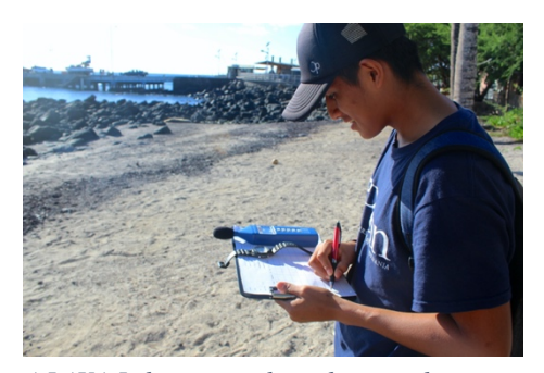
A LAVA-Lobos researcher takes sound measurement on Playa de Oro. This is used as one measure of human disturbance.

The project is a partnership between the Galápagos Education and Research Alliance and a San Cristóbal high school, the Unidad Educativa Fiscomisional San Cristóbal . Students from the school are the primary field researchers and collect data twice weekly from July-December on several municipal beaches. They study sea lion groupings, demographics, behaviors, and responses to a human's approach. This protocol was carried out in 2017, 2018, and 2019. Given the pandemic, our team is working to adapt the project for online learning for our 2020 participants.