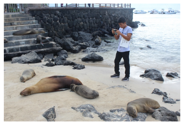
A LAVA-Lobos researcher completes a photography protocol on Playa De Oro. Photos are being used to develop photo tagging software for identifying individual sea lions.

LAVA-Lobos is a community science initiative which investigates the impact of human presence on the behavior and social structure of the endemic Galápagos Sea Lion ( lobos marinos in Spanish). The Galápagos sea lion, Zalophus wollebaeki , is an integral part of the ecosystem and culture of San Cristóbal. These charismatic pinnipeds are endemic to the Galápagos and San Cristóbal is home to their largest population. The sea lions are such an iconic part of local life that they are referred to as 'the face of San Cristóbal'.