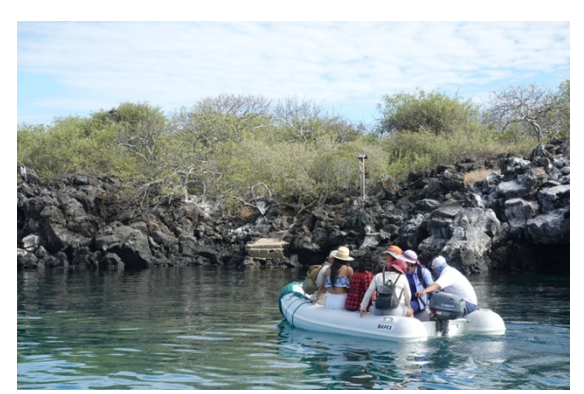
A Con Galápagos group lands on Isla Lobos.

Galapagueños' lives and livelihoods are intimately linked to the archipelago's limited resources, and they are the ones most impacted by conservation restrictions. Yet few Galapagueños have had the opportunity to experience the park they protect; exorbitant prices limit park access to researchers and international tourists. We believe that the Galapagueño community must have the same opportunity to come to know (conocer) the National Park as is afforded to tourists and scientists.