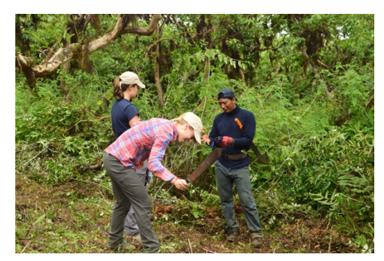
GERA team members clear a patch of invasive blackberry.

The invasive of focus in our 2019 pilots was Rubus niveus , a blackberry species described as "the worst weed in the Galápagos." For our investigation, the GERA team cleared several previously infested plots of land in the San Cristóbal highlands and tested the effectiveness of planting different native and agricultural species at preventing blackberry regrowth.