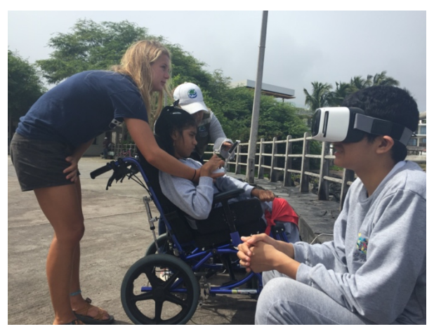
A group of differently-abled school children use the underwater drone.

with Penn students leading virtual training sessions on marine biology, scientific methodology, and diving skills. As the dive club adapts to COVID-19 regulations and opens for diving, the students will once again start collecting data.