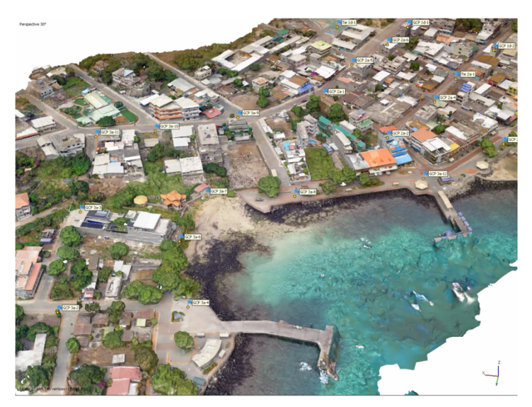
3D Topo-Bathy model of Puerto Baquerizo Moreno created with novel drone mapping technique. Such models are essential for climate resilience planning.

The Alliance design team includes landscape architects working to create climate resilient designs in order to prevent the humanitarian disasters that could accompany climate change in Galápagos towns. According to recent reports from the Intergovernmental Panel on Climate Change (IPCC), we are already seeing substantial effects of climate change. These changes will continue to become more extreme. even under the most aggressive carbon reduction plans. In order to prevent the