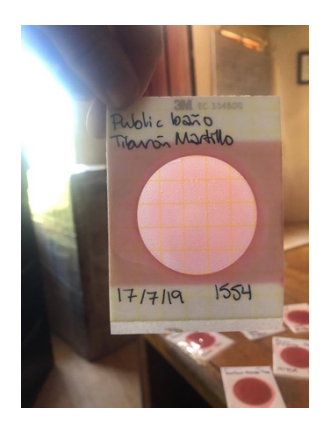
Example of coliform test performed as part of the protocol.

Preliminary testing of tap water on San Cristóbal in 2018 found that the majority of tap water samples had coliforms present, while only one location tested positive for chlorine in the water at tap. Chlorine is necessary to kill harmful pathogens and its absence highlights issues with water quality. We expanded our approach in 2019, conducting tests in 52 homes and businesses and partnering with a local Scout troop to deliver educational content around water quality. We are also developing protocols that can be used in other settings, like schools, to teach the protocol and to educate students and their families about water treatment.