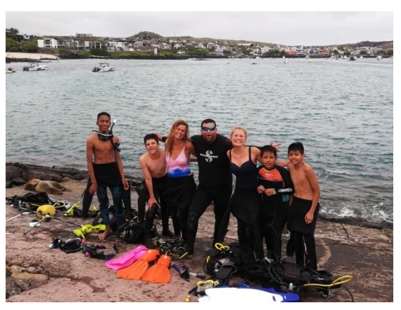
GERA team members with the Wreck Bay Dive Club after conducting a benthic survey.

LAVA-Mar encompasses two projects designed to engage San Cristóbal residents with the coastal marine ecosystem bordering the municipal areas of the Island. Despite growing up surrounded by an internationally renowned marine ecosystem, most residents of Puerto Baquerizo Moreno have never interacted with the underwater world. Many locals are not able to swim or lack the confidence to swim in the ocean. In addition, snorkeling or scuba diving tours are economically infeasible for most locals. As a result, very few Galapagueños have explored the ocean in